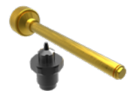
Nozzle / extension Application image